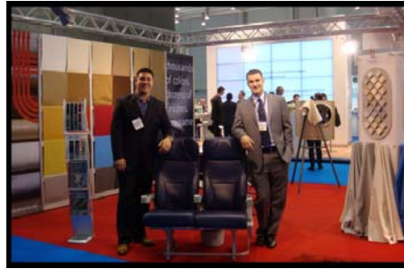
Aircraft Interiors Expo 2010

Tapis again enjoyed a successful event at Aircraft Interiors Expo in Hamburg, Germany in May. We also exhibited at our first EBACE in Geneva, Switzerland, which was also a valuable and worthwhile experience for our business.