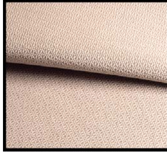
6 New Colors of Geneve

Please email info@tapiscorp.com or call 914.273.2737 to request samples!